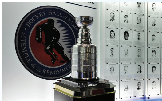
Stanley Cup Photo

Experience the game that defines Canada and a sport that has been adopted by over seventy countries in the Hockey Hall of Fame! The Hall of Fame offers hockey artifacts at all levels of play from around the world; a replica NHL dressing room; exhibits dedicated to the game's greatest players, teams, and achievements; and NHL trophies, including hands-on access to The STANLEY CUP.