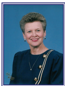
2012 GFOASC Spring Conference Closing Speaker